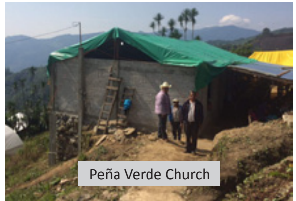
Peña Verde Church

and lack of space, had been unable to do so. This past year, they proposed among themselves to enlarge their meeting area for this purpose and with great physical effort of this mostly elderly group, they were able to dig into the mountain and lay the foundation for a larger building (they do not have flat areas of property in this area of the mountains). God graciously provided the materials to build the walls and a tarp for the roof, and for the first time since this church began almost thirty-four years ago, they were able to have this special Bible Conference. As the brethren started to arrive from many different parts of the state of Oaxaca , including brethren from the Mixe , Chinanteco and Cuicateco villages , other people (unbelievers) in Peña Verde were moved to participate with the church. They