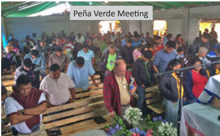
Peña Verde Meeting